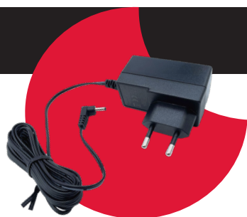
Power transformer 230VAC/12VDC included