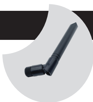
Swivel antenna (included)