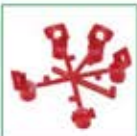
2. UNIVERSAL TOOL