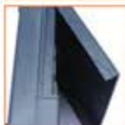
4. 3" BACK LIGHT LCD SCREEN